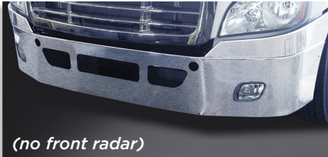
(no front radar)

Cascadia: chrome, replaces plastic/composite