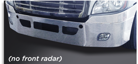
(no front radar)

ABP N31 GCY501115X fog lights (shown) ABP N31 GCY001115X no fog lights