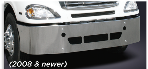
(2008 & newer)

ABP N31 OCOA101117 fog lights ABP N31 OCOA001117 no fog lights (shown) For gliders: note chassis year when ordering