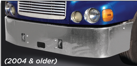
(2004 & older)