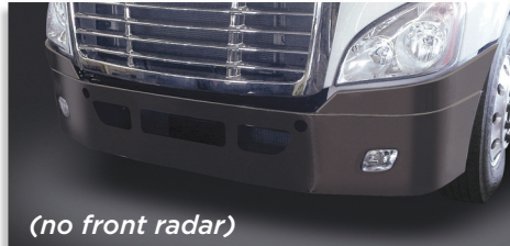
(no front radar)

ABP N31 OCY501115X fog lights (shown) ABP N31 OCY001115X no fog lights