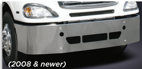
(2008 & newer)